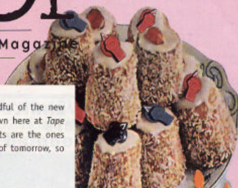
MADELEINE CAKES with EMI Cherries